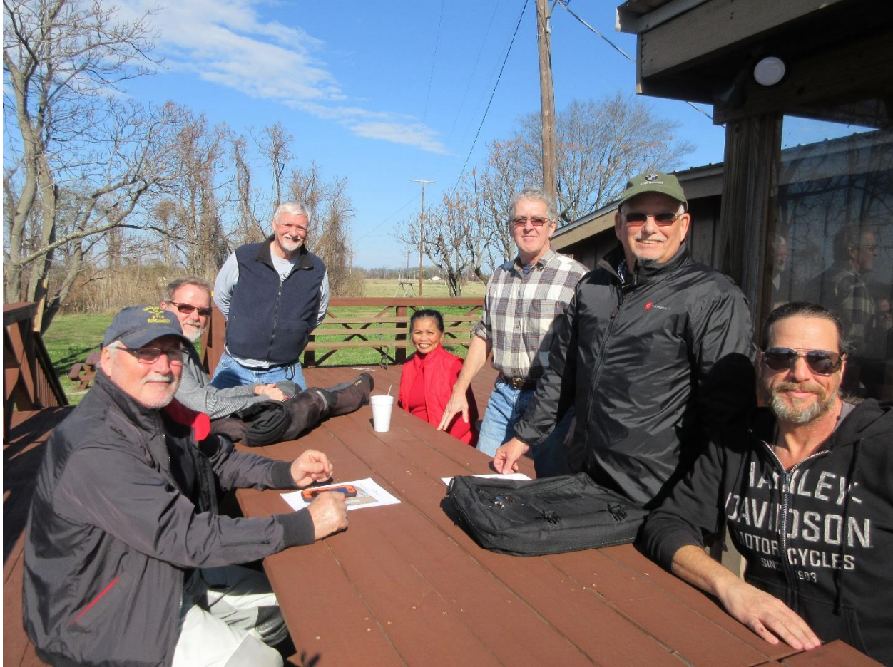
Lake DeGray Lodge